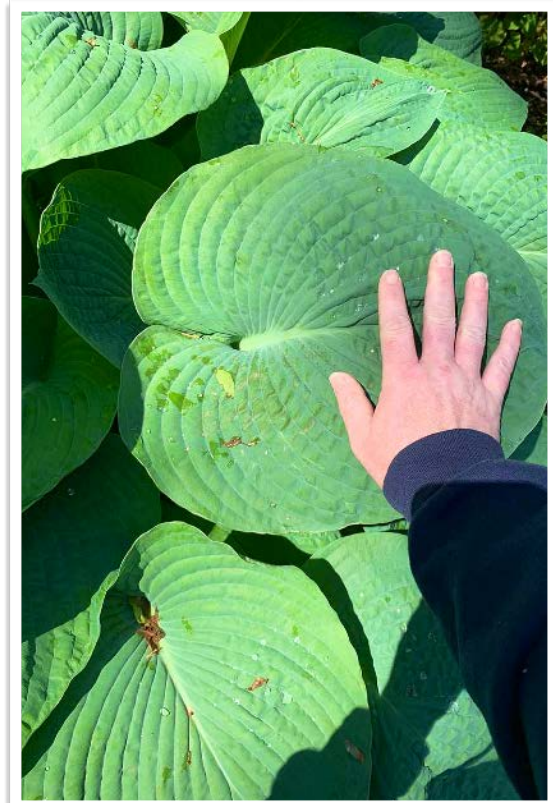
H. 'Empress Wu'

In addition, a hard frost or freeze in late spring can cause irreparable damage to the crown, resulting in stunting and fairy ring. This can set a large hosta back several years and some may never recover. You cannot afford to let your prized specimens to be affected, so protect the hosta crowns