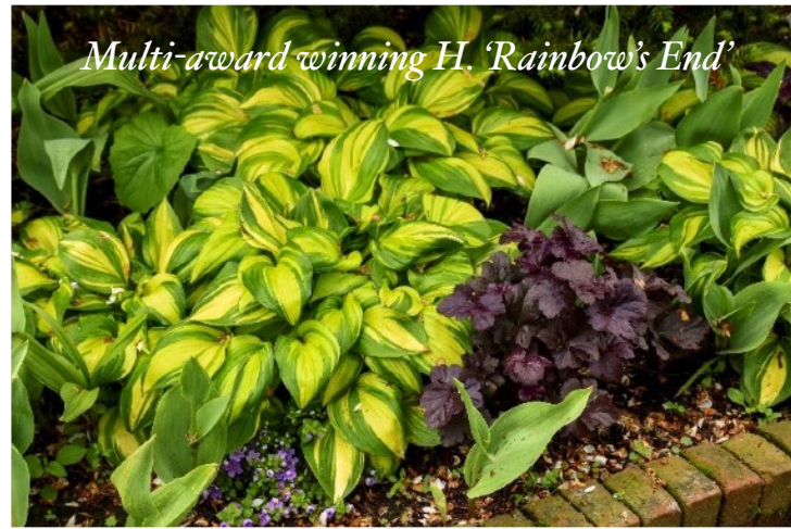
Multi-award winning H. 'Rainbow's End'

program by the American Hosta Growers Association. "The American Hosta Growers Association is a trade organization for nurseries that specialize in the growing and the sale of hostas." Members of this group are growers and distributors of hostas. They vote annually for their favorite hosta for "Hosta of the Year". This year's Hosta of the Year is H.